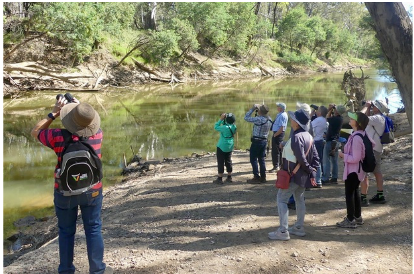
Members birdwatching next to the Goulburn River 19th Nov